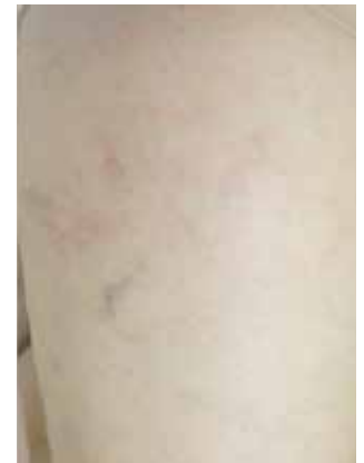
After 4 treatments

Remove unsightly leg veins. Non surgical treatment that's quick, safe and easy. Lose the veins and regain your confidence